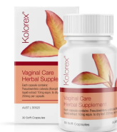
Kolorex® Vaginal Care Herbal Supplement